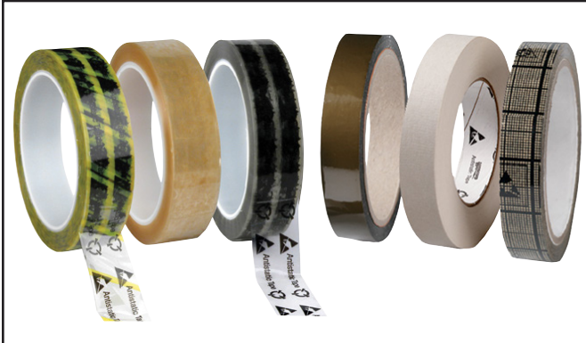
Wescorp ESD Tapes

In ESD protected areas, replace regular high charging tape with Wescorp ESD Tape. ANSI/ESD S20.20 section 8.3.1. states "All nonessential insulators, such as those made of plastics and paper (e.g., coffee cups, food wrappers and personal items) must be removed from the workstation."